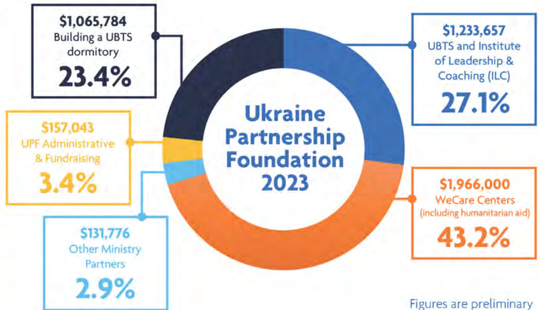
Figures are preliminary